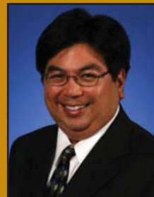
Michael Yaki Commissioner U.S. Commission on Civil Rights